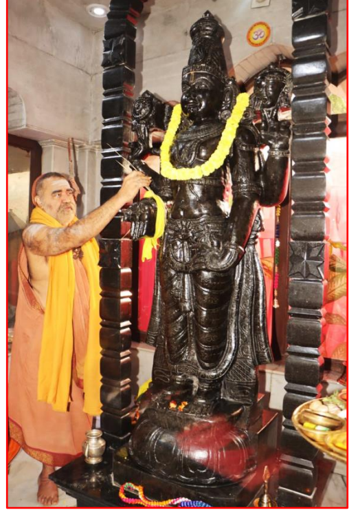
Yatra at Prayagraj concludes with Prana Prathishta of Sri Venkateswara Swami 23-Nov-2023