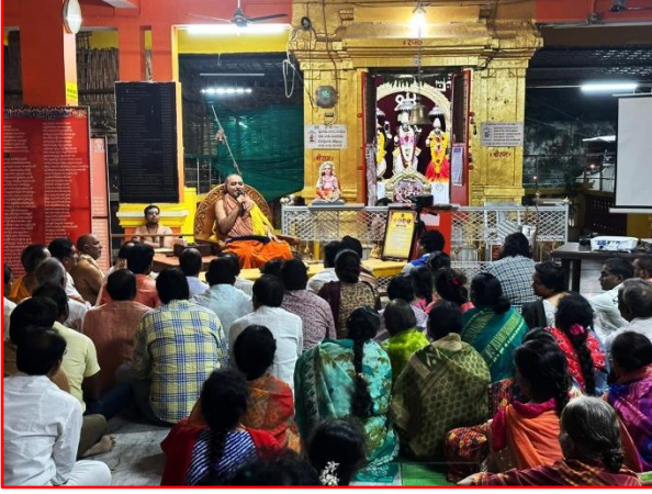
Vijaya Yatra - Karthika Somavaram at Adilabad 11-Dec-2023

10-12 Dec. Adilabad | 13-14 Dec. Nizamabad | 15 Dec. 2023 - 15 Jan. 2024 - Secunderabad